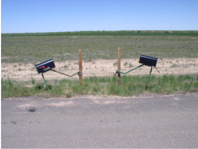
Figure 3. The Roadside Safety Devices mounting system does not reliably return to the centered position.

The Roadside Safety Devices system – Mailboxes mount to a long metal arm that attaches to a pivot bolted to a 4” x 4” wood post. This system is designed to allow the box and arm to swing away from the plow blast. The assembly should then re-center itself after the plow has passed. As the picture shows, the mailboxes were not damaged during the winter. However the system does not return the box to