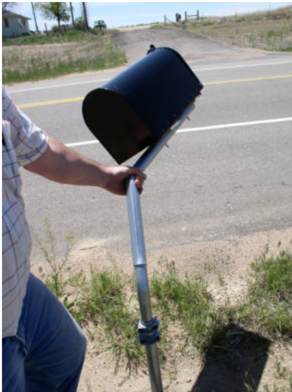
Figure 2. The box and top section of the mount swing to the side and up.

The Friend Innovations system – A three-piece all-metal post system allows the mailbox to swing to the side when hit by the snow thrown by a passing plow. The swinging action of the mount absorbs most of the impact from thrown snow, slush and ice. The geometry of the design uses gravity to swing the box back to its original position. The metal box in the picture ( Figure 2 ) has survived through the winter with no damage.