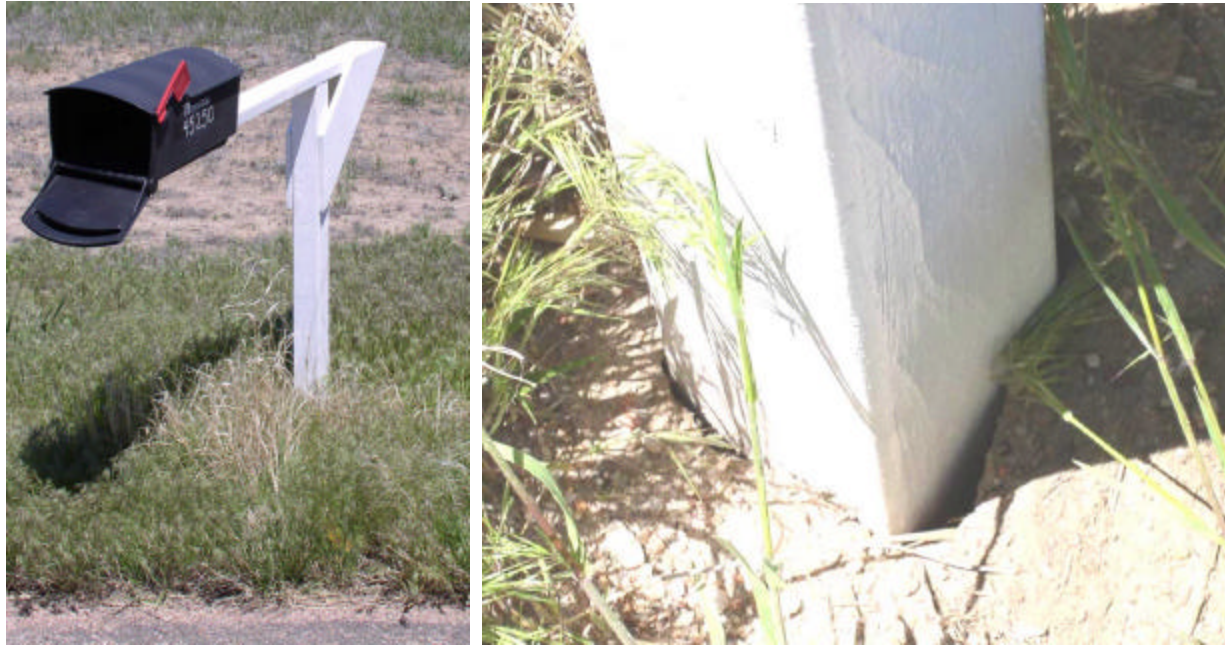
Figure 5. The plastic box is good condition, but the twisted post shows the effects of being hit by the snow thrown by passing plows.

This system, with a cost of $28.38 for the materials, and assembly and installation time of 2