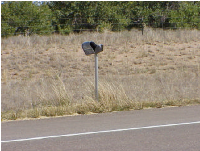
Figure 1. Mailboxes mounted near high-speed highways are susceptible to damage from the blast of snowplow during the winter.

On rural highways mailboxes are placed close to the edge of the pavement, where the mail carrier can reach them from a vehicle. They have been mounted on a wide variety of interesting, artistic, and sometimes bizarre bases ranging from welded chain to stone columns to an antique miniature bulldozer. Safety regulations have eliminated that form of creativity in most instances because a mailbox mounted near a highway is considered a hazard and is required by law to be designed to do as little damage as possible to a vehicle that hits it. The mounting post must be a break-away design with a base that will not cause a small vehicle to roll over. The top of the